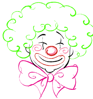
Reaching the world for Jesus, one smile at a time.

I can't tell you how much I enjoy clowning. There is so much you can do in costume. I love the children, their hugs, and their respect. They have a lot of energy and imagination. They have the