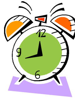
Rise and shine with the Lord at the new 8:15 am early Sunday worship service starting May 27.

The second fellowship and the Spanish Worship probably will not start right away but eventually it will be a regular part of our Sunday as our Hispanic brothers and sisters in Christ join us as one loving body through the