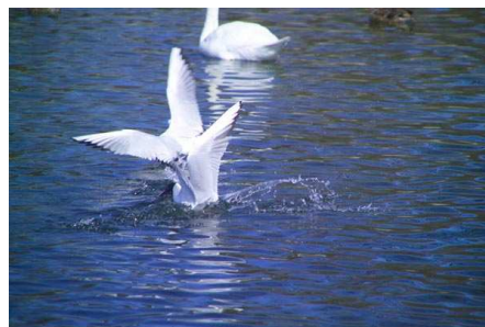
Get ready to Make A Splash in this year's Vacation Bible School. ... Take the Plunge!

We are planning for at least 100 children here for the week of June 10–15 from 6:30–9 pm each evening. Many children come to know Jesus Christ as their personal Savior during VBS each