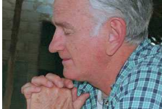
The CP continues to be a tool for reaching people all over the world.

Southwestern, Golden Gate, and New Orleans) educate in excess of 16,000 pastors, missionaries, and future church leaders each year.